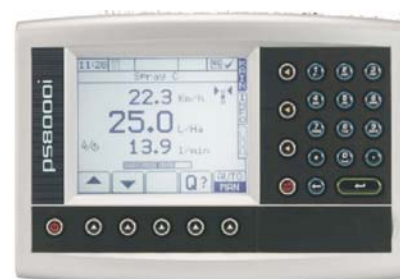
RDS Delta 34i

This unit is purpose made for this application and is very competitively priced from £1,500 which includes the display head, wiring looms and GPS speed sensor. This item is in addition to our existing range of cab monitors.