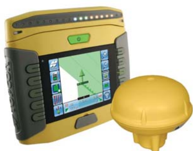
Topcon system 110 Light Bar Guidance System

We can e-mail this Newsletter if you let us know your address!